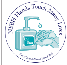
Buttons, Designed by NEBH and printed by www.EveryoneLoveButtons.com